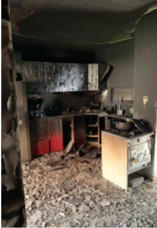
Kibbutz Holit after October 7, 2023