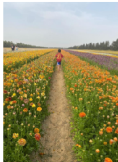
Kibbutz Holit before October 7, 2023