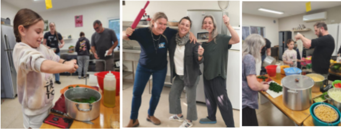
Opening of the interim kitchen at Ein Gedi on January 1